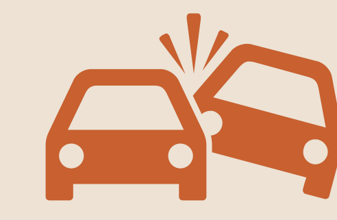
Following another vehicle too closely